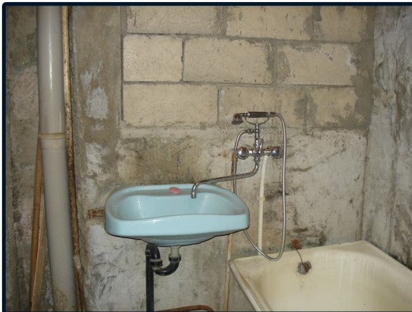
Spitak city: Apartments with polished looks (above) house such interior conditions (below.)

The preparations of the renovation project in Spitak are almost complete. We anticipate starting selecting families in the spring. The anticipated time for the interventions to be completed is by the end of building season 2010.